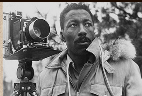
GORDON PARKS (1912-2006)

The first American woman to win three gold medals in track & field at a single Olympics. Initially told that she may never walk again due to suffering as a child from double pneumonia, scarlet fever and polio which caused her to wear a brace on her left leg. But through determination and physical therapy, she was able to overcome her disabilities and compete at 16 and win a bronze medal in the 1956 Summer Olympics before later competing and winning three gold medals at the 1960 Olympics. In the 1980s, Wilma was inducted into the U.S. Olympic Hall of Fame and established the Wilma Rudolph Foundation to promote amateur athletics.