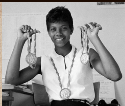
WILMA RUDOLPH (1940-1994)